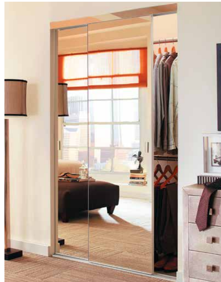
Brittany® pictured in a White finish with matching mirror fascia