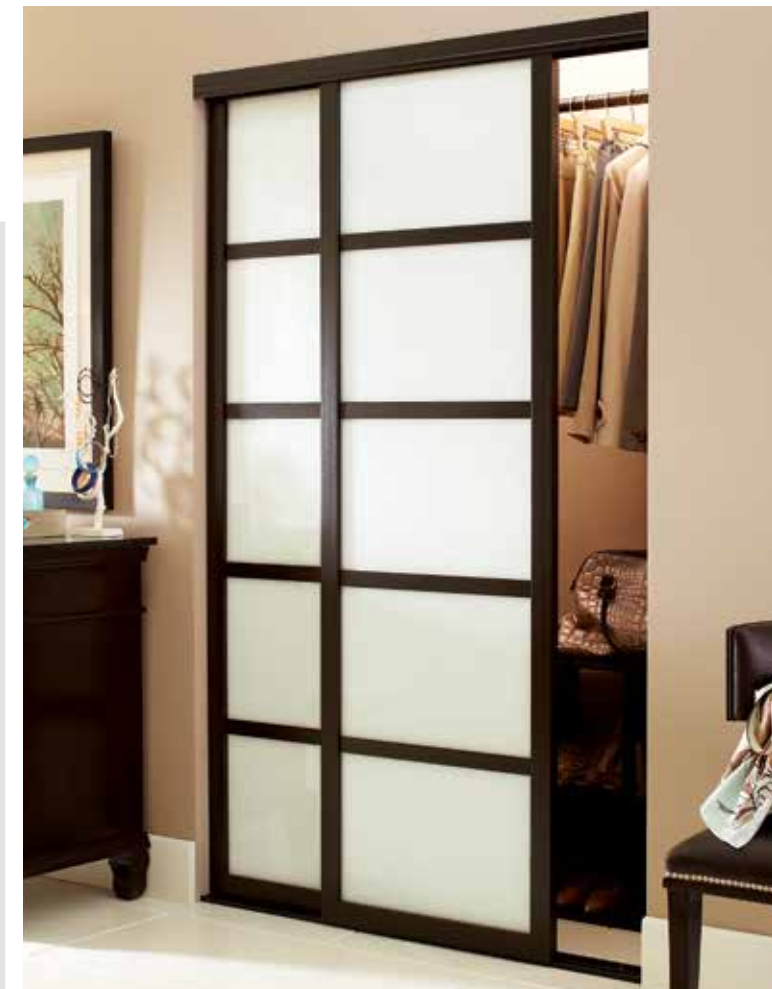
Tranquility™ 5 lite equal pictured in an Espresso finish