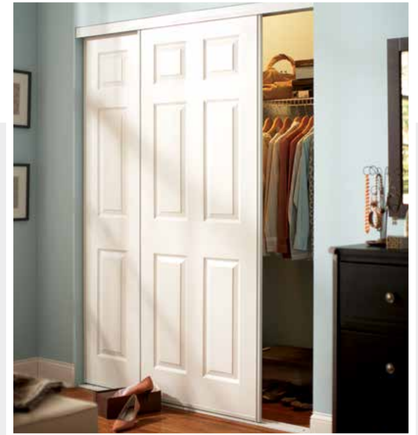
Colonial™ pictured in a Gloss White finish with raised 6 panel White hardboard