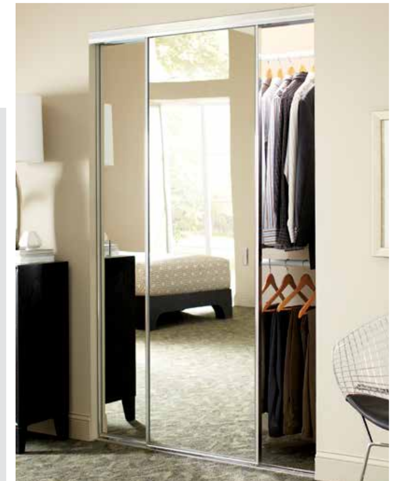
Aurora™ pictured in a Bright Clear finish