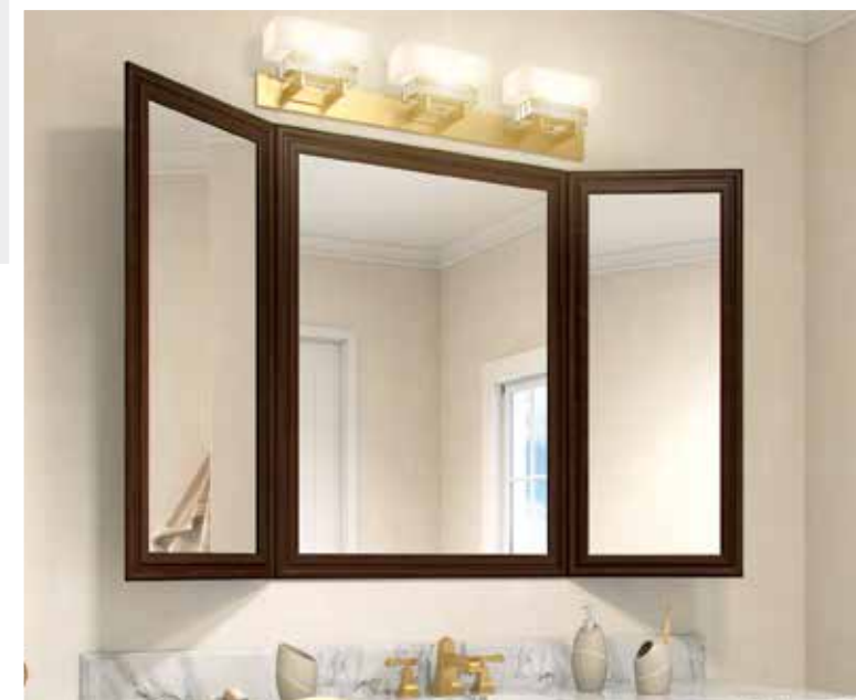
Oak Fantasy® Vanity Flair pictured in a Dark Stain finish