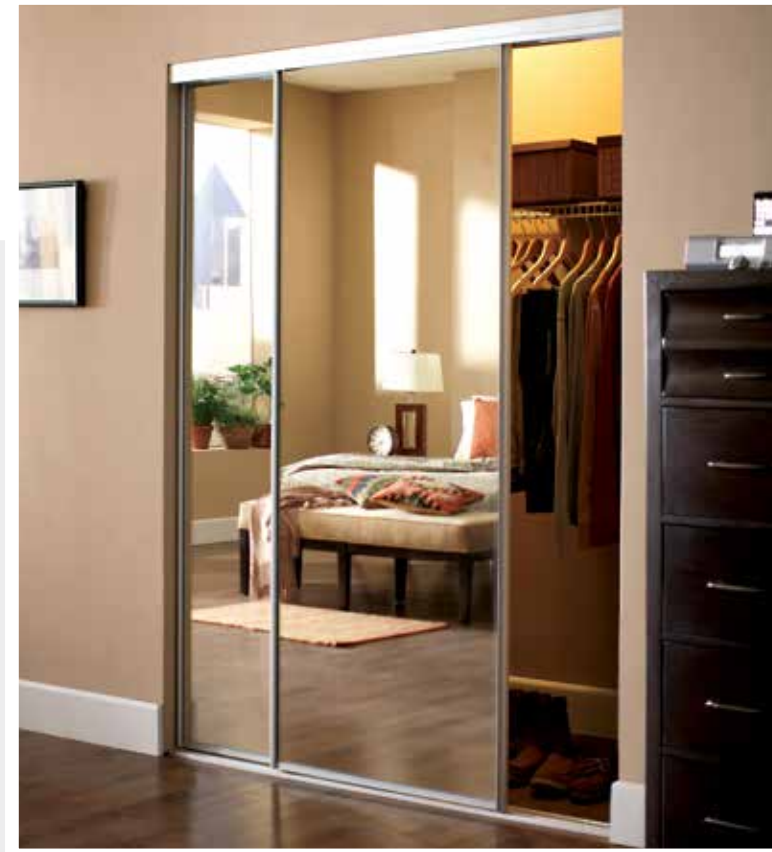
Pacifica® pictured in a Satin Clear finish