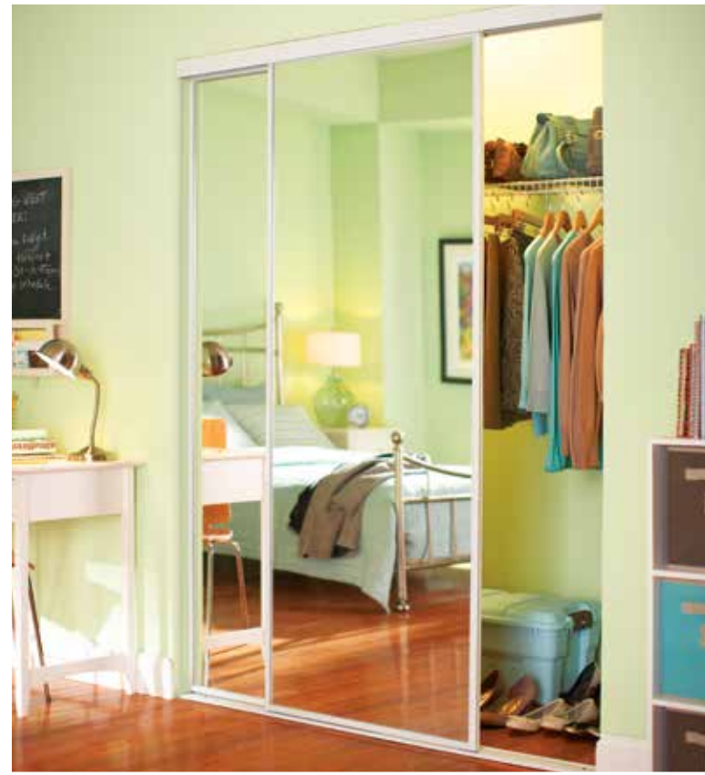
Savoy™ pictured in a Gloss White finish