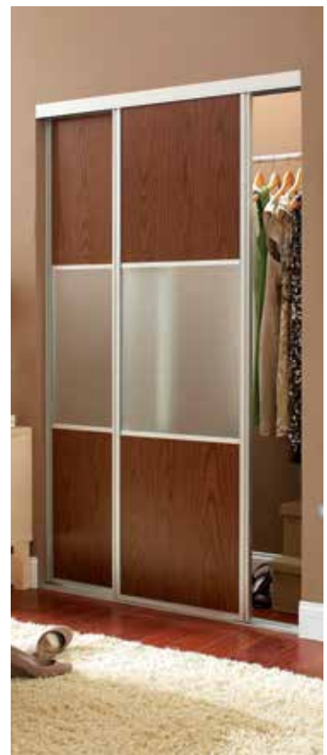
Concord™ 3 lite equal in a Satin Clear finish with Walnut wood grain panel inserts and Mystique™ Duratuf® tempered safety glass