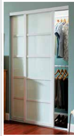
Tranquility® 5 lite equal in a White finish with Snow White back painted glass

True divided lite door patterns are an essential element for adding a defining characteristic to a wide range of styles. From elegant, old-world to arts and crafts and even the most minimalist, modern designs, true divided lite offers a multitude of panel configurations separated by our H-bar.